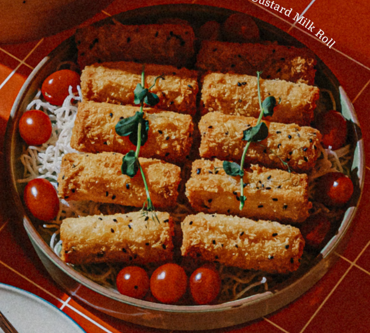
Azuki Bean Custard Milk Roll