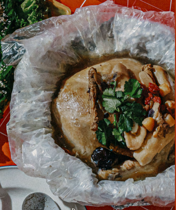
Emperor's Herbal Whole Chicken