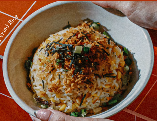
Golden Mountain Fried Rice