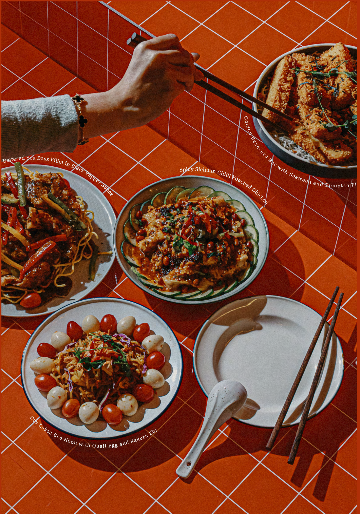
Battered Sea Bass Fillet in Black Pepper Sauce