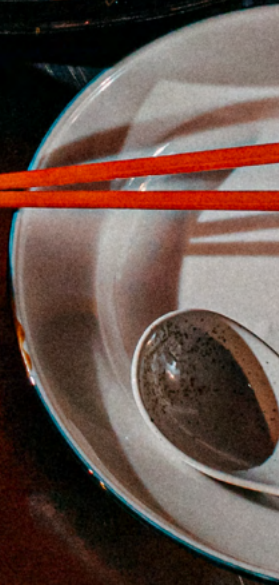
Four Seasons' Prosperity Yusheng