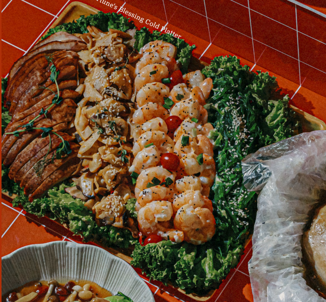
Fortune's Blessing Cold Platter