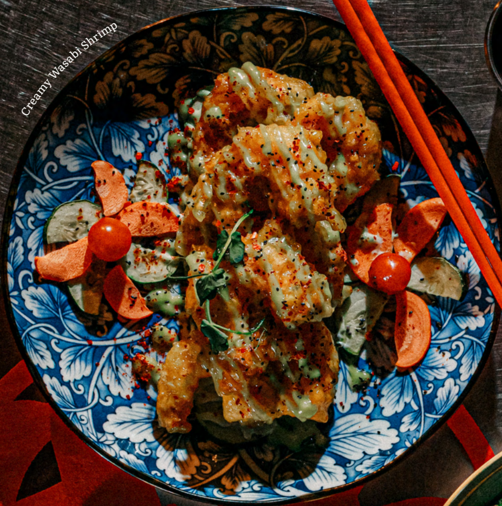
Creamy Wasabi Shrimp