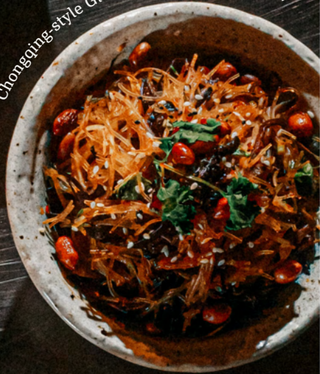
Chongqing-style Glass Noodle Salad (Vegan)