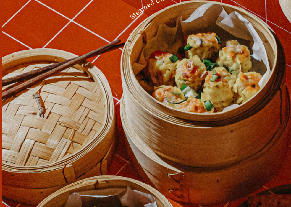
Steamed Chicken Siew Mai