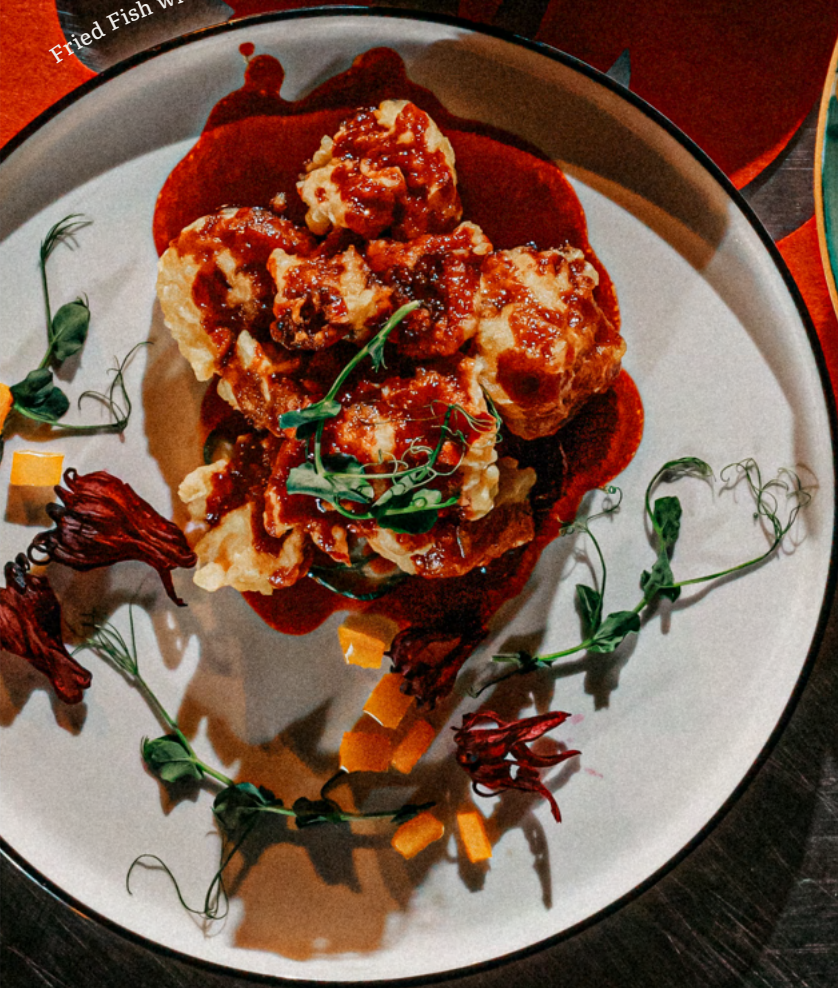
Fried Fish with Roselle Sauce